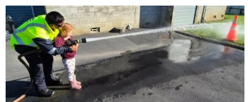
Aubrey is training to be a fire fighter. She's holding on tight to that hose and she's got great aim! Rawe Aubrey!