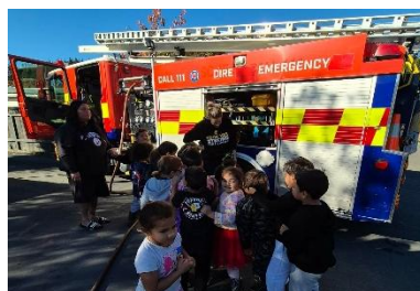
Ngā Pōtiki are lining up to see who's going to be the first to meet the lady firefighter!